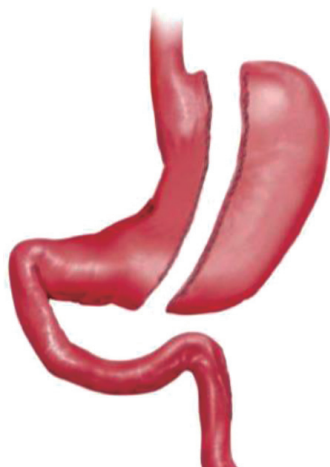
Figure 2 Sleeve gastrectomy.

the birth of the LSG, which now is the primary and basic bariatric procedure. Sleeve gastrectomy is designed to be the restrictive component of BPD-DS in the beginning. For those high risk patients (ex. super-obesity or poor cardiopulmonary function patients), LSG was used as the first-step surgery prior to the two-stage procedure. It now becomes the primary one-step procedure (13-15). The simplicity of the procedure, effectiveness of weight loss, less postoperative morbidities and prominent resolution of comorbidities makes LSG become so popular. Although LSG has satisfied weight loss comparing with intensive medication therapy, LRYGB is still better than LSG on many aspects such as the resolution of T2DM and results of weight reduction. In order to reach a comparable results