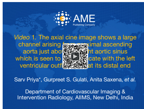
Figure S1 The axial cine image shows a large channel arising from proximal ascending aorta just above the right aortic sinus which is seen to communicate with the left ventricular outflow tract at its distal end (20). The channel shows proximal narrowing and a distal aneurysmal portion, before its drainage into left ventricular outflow tract. The channel is seen to obstruct the right ventricular outflow tract and the right ventricle from its superior aspect. AO, aorta; T, tunnel; N, neck of tunnel; LV, left ventricle; RVOT, right ventricle outflow tract; RV, right ventricle.

Available online: http://asvidett.amegroups.com/article/view/22309