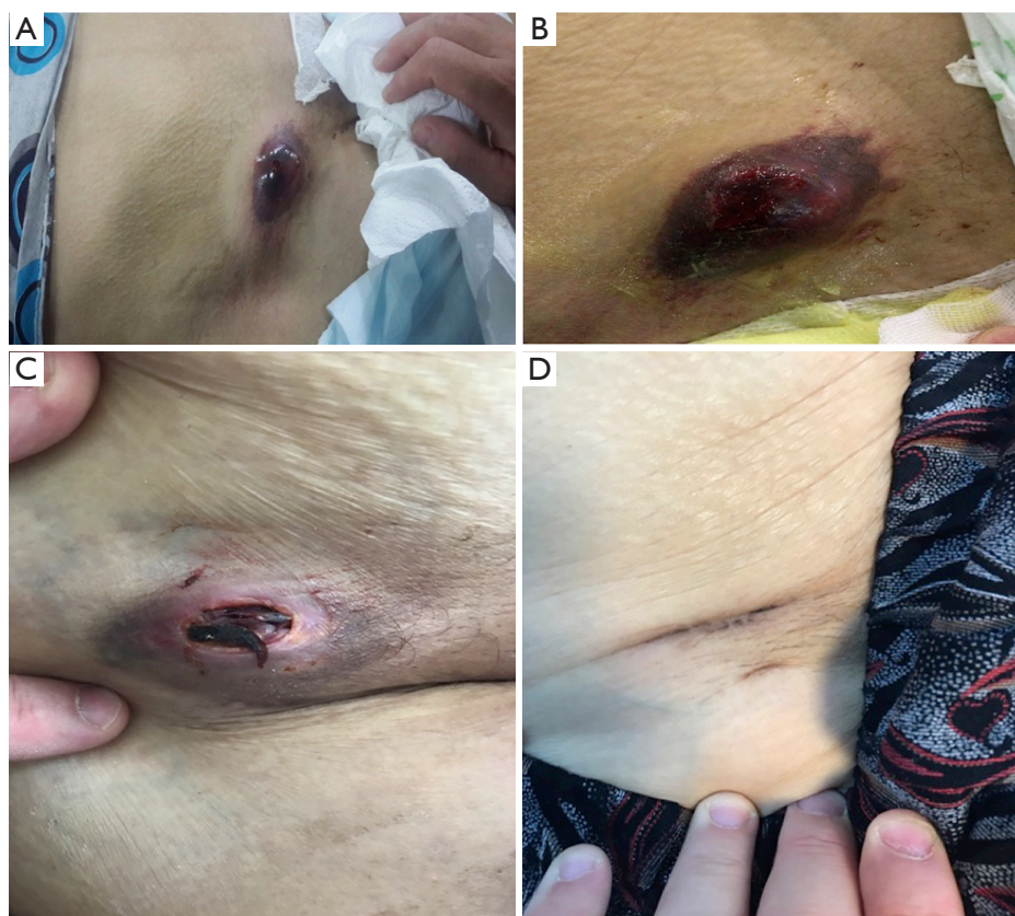
Figure 6 Observation of the palpable, painful, and pulsatile mass in right groin during follow-up. (A) At 21th day after the TAVI procedure; (B) still palpable at the next morning after balloon-expanding graft stent implantation; (C) one-week of follow-up; (D) second month of follow-up. TAVI, transcatheter aortic valve implantation.

follow-up period, we have not found any technical cause of failure. Nevertheless, we observed that arterial blood gas sampling was taken from right femoral artery twice while hospitalizing in pulmonary disease clinic. It may be one of the possible causes of femoral pseudoaneurysm. When we reviewed the literature, we could not find a case report that reported late-onset failure of a vascular closure device. From this point of view, our case is unique one.