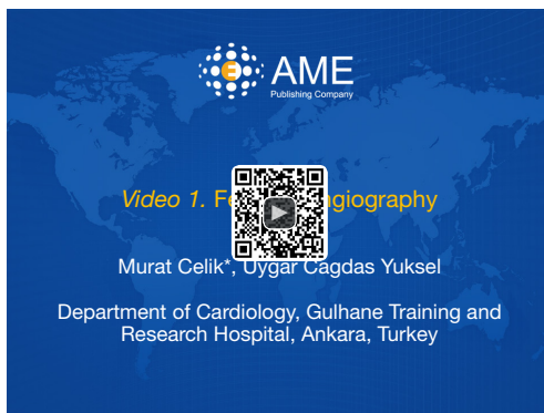
Figure 2 Femoral angiography (2).

Available online: http://www.asvide.com/article/view/27318