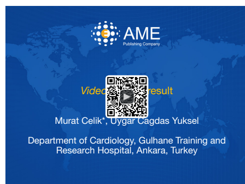
Figure 5 Final result (5).

Available online: http://www.asvide.com/article/view/27320