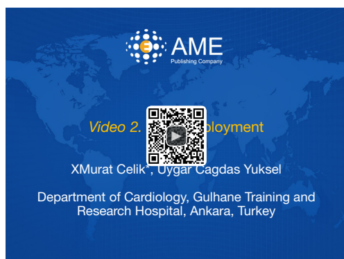
Figure 3 Stent deployment (3).

Available online: http://www.asvide.com/article/view/27319