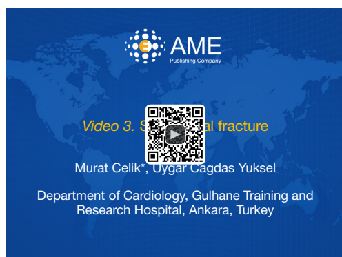
Figure 4 Stent distal fracture (4).

Available online: http://www.asvide.com/article/view/27319