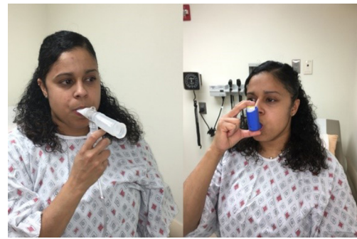
Figure 3 Inhalation drug delivery devices: nebulizer (left panel) and metered dose inhaler (MDI, right panel).

LAMA (tiotropium, aclidinium, umeclidinium) were