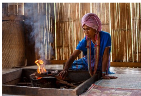
Figure 1 Continuous exposure to smoke from burning biomass is not uncommon in some societies even today.

COPD is an irreversible, chronic condition. FEV 1 begins to decline steadily early in life. Smoking accelerates this process. Smoking cessation returns the patient to their natural age expected rate of decline, but the existing damage is permanent ( Figure 2 ). Early and accurate diagnosis is essential in order to slow down further deterioration. It is important to identify individuals with risk factors, especially smoking. Once the diagnosis is established, a strong emphasis is placed on risk factor elimination. Very few treatment options influence overall mortality once COPD has developed. The primary goals in the management of COPD are to slow progression and palliate symptoms. The evolution of the disease is monitored by spirometry. Preventing exacerbations and hospitalizations is important, both from the prospective of disease progression and quality of life. COPD trajectory is a step-wise curve and the lung function decline is often