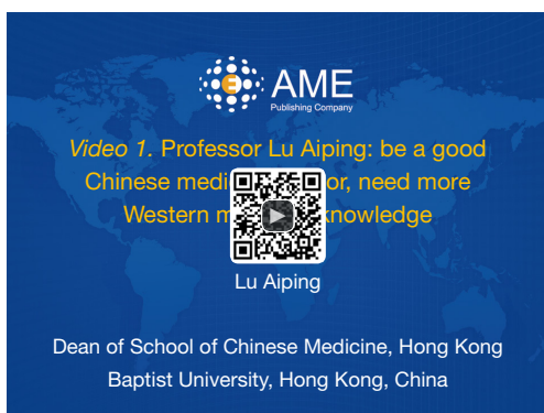
Figure 3 Professor Lu Aiping: Be a good Chinese medicine doctor, need more Western medicine knowledge (1).

Available online: http://www.asvide.com/article/view/29211