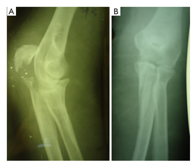
Figure 1 Preoperative X-ray view of the patient sustaining an intra-articular, comminuted, fracture of the left proximal ulna. Olecranon, coronoid process and the shaft of ulna are separated. (A) Lateral view. (B) Anterioposterior view.