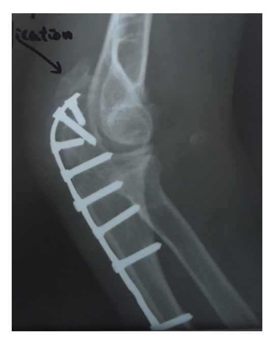
Figure 3 Occurrence of heterotopic ossification in the triceps muscle.