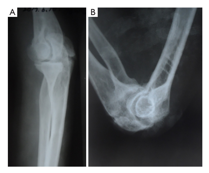
Figure 4 X-ray view of the elbow after removal of HO and implants. (A) Lateral radiograph view of the extended elbow. (B) Lateral radiograph view of the flexed elbow.

At approximately 8 weeks the evidence of union was revealed on plain radiograph, but she didn't recover her functional range of elbow motion, although professional physical therapy was applied.