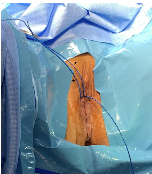
Figure 1 Stents placed into the fistulous tract (*) and the right ureter (unlabeled).