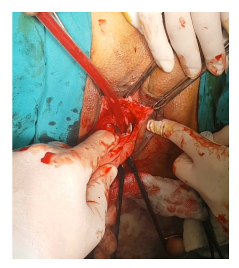
Figure 2 Cervical tunneling step on the sidewalls of the cervix.

Figure 1 Semilunar incision (3 cm) in the upper lip of the cervix.