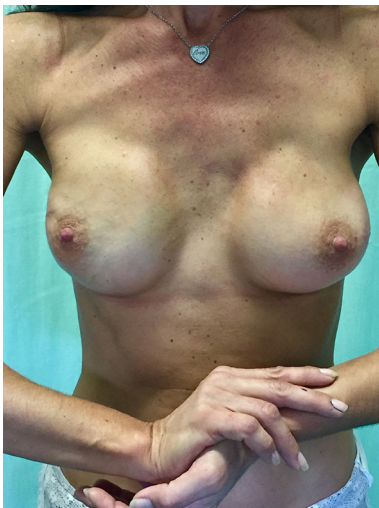
Figure 7 Postoperative picture 6 months after revising surgery showing a PMM contraction maneuver. The clavicular portion of PMM only is contracting, while the sternal and costal aspects are not moving and not animating the implants. PMM, pectoralis major muscle.

the 6-month follow-up questionnaire. The BREAST-Q reconstruction module was divided into five independent scales with a transformed score ranging from 0 to 100, as reported in our previously published papers (11,12). The two scales of “satisfaction with outcome” and “physical