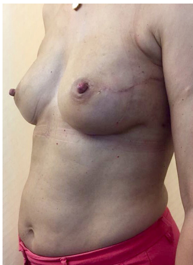
Figure 3 Postoperative picture 6 months after a dual plane DTI breast reconstruction with selective PMM denervation and a contralateral breast augmentation for symmetry. No rippling or implant rim signs are visible on the anterior chest wall. DTI, direct-to-implant; PMM, pectoralis major muscle.