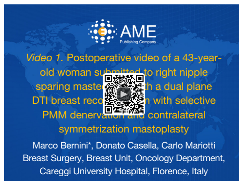
Figure 4 Postoperative video of a 43-year-old woman submitted to right nipple sparing mastectomy with a dual plane DTI breast reconstruction with selective PMM denervation and contralateral symmetrization mastoplasty (27). After 2 weeks from surgery, it is clearly evident at PMM voluntary contraction maneuver that only the clavicular portion is moving while the costal and sternal aspects are denervated. The implant positioned on the right side is not animated at all. On the left side the whole muscle is intact and contracting normally. DTI, direct-to-implant; PMM, pectoralis major muscle.

Available online: http://www.asvide.com/articles/1827