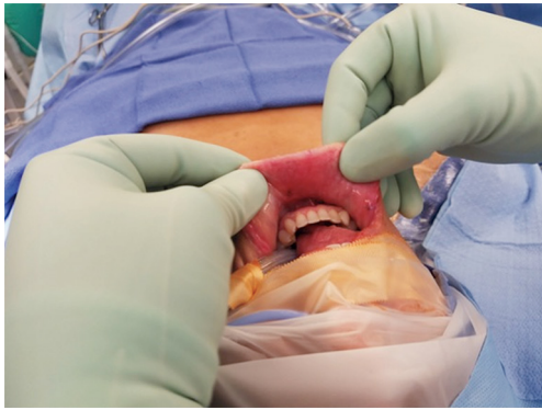
Figure 1 Intraoperative image demonstrating positioning for completion thyroidectomy via TOETVA. Trocars were placed at the same sites as the previous intraoral incisions, which are identified only by the remaining absorbable suture.