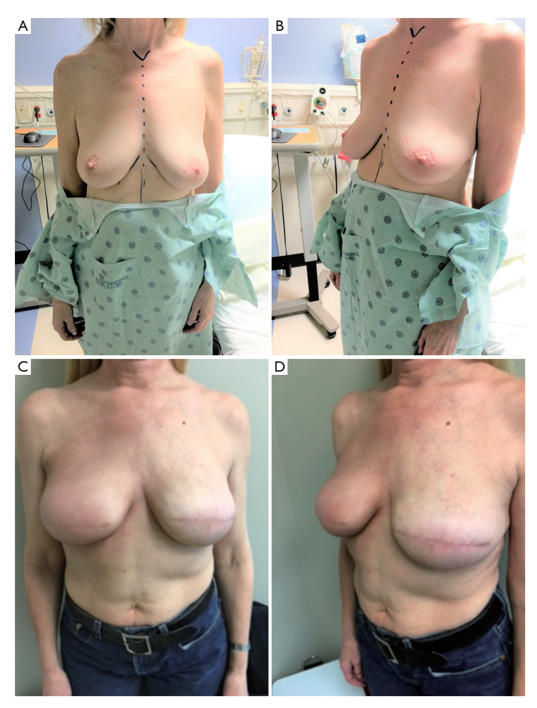
Figure 2 Bilateral skin sparing mastectomy with immediate implant reconstruction followed by post-mastectomy photon beam therapy. (A,B) A 53-year-old woman with a diagnosis of invasive right breast cancer. She underwent PMRT of her right breast following bilateral mastectomy and immediate direct-to-implant reconstruction with anatomical gel implants (Natrelle Style 410 MX 685 cc) and AlloDerm RTU (extra thick, 640 cm<sup>2</sup>); (C,D) patient at 6 months following completion of radiotherapy and no fat grafting. PMRT, post-mastectomy radiation therapy.

When expander irradiation is planned, tissue expansion is completed before irradiation. Fat grafting is usually necessary in irradiated breasts to improve overall aesthetics.