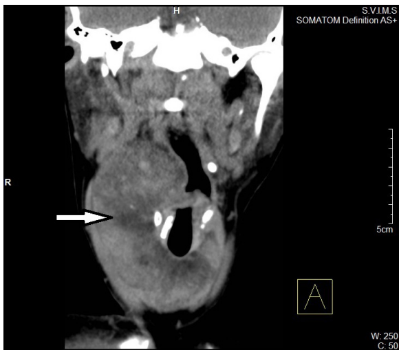
Figure 1 CT coronal reformed image: heterogeneously enhancing mass (white arrow) in right lobe of thyroid with low density areas (-8 to -18 HU) and mass effect on oropharynx. CT, computed tomography; HU, Hounsfield unit.