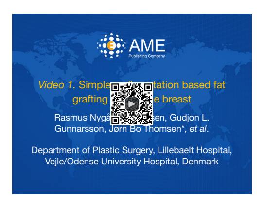
Figure 1 Simple sedimentation based fat grafting (FG) of the breast (4).

Available online: http://www.asvide.com/articles/679