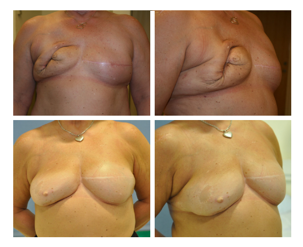
Figure 3 Before and after images showing correction of failed immediate breast reconstruction using a licap flap in combination with fat grafting (FG).

volume increase following FG (3,8). The encountered complications were similar to other studies, namely fat necrosis, infection and oil cysts (9-11). The most frequent observed complication was oil cysts, which compares to the findings of other studies (10,12-14). Oil cysts in this study were cysts which could be palpated and then confirmed by ultrasonography. We did not routinely scan patients; however incidental findings were always easily identified as benign by ultrasonography or mammography. The overall complication rate was acceptable (2%) which compares to the complication rate of 2.8% reported by Petit et al. (14). The oil cysts occurred in early large volume FG's which has leaded us to change our approach and reduce the injected volumes. With experience we have found that less is more, which is in line with the findings of others (6).