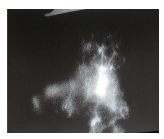
Figure 5 Indocyanine green (ICG) immunofluorescence 'stardust' pattern.

lymphoedema, ICG pooling represents a diffuse pattern.