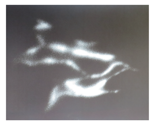
Figure 4 Indocyanine green (ICG) immunofluorescence 'splash' pattern.