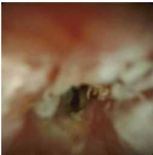
Figure 2 Cholangioscopy of CCA. CCA, cholangiocarcinoma.

ductal biopsies can be obtained using either wire-guided biopsy forceps, regular forceps or pediatric forceps with a combination of fluoroscopy to determine the location of the stricture. Biopsy specimens are generally placed in formalin to be analyzed by a pathologist and allow for a larger sampling size compared to brushings. Nevertheless, similar to brushings, a recent meta-analysis of nine studies demonstrated that the yield of intra-ductal biopsies was low, with a sensitivity less than 50%, but a specificity also around ~99% (12). The idea of performing both brushings and intra-ductal biopsies has also been studied, with the thought that the combination of the two would improve the sensitivity over either one individually. Similarly, since they are both performed during ERCP, it would not require another procedure, and would only add a minimal amount of additional time to the procedure. Nonetheless, the combination of brushings and intra-ductal biopsies only increased the sensitivity to 59%, with a specificity of 100% to detect malignant biliary strictures (12).