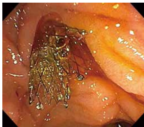
Figure 6 Endoscopic view of side-by-side SEMS insertion. SEMS, self-expandable metal stent.

cost-less and can be placed in multiple segments without difficulty. The main disadvantage is that due to their smaller diameter, they require prophylactic stent exchanges to prevent obstruction. The most common size of plastic stents are 7 and 10 French in diameter. Self-expanding metal stents come in a variety of sizes, from 6 to 10 mm, and can be either uncovered, partially covered or fully covered. The advantage of SEMS is that they generally show longer patency, with the disadvantage being higher cost, and if uncovered, the inability to remove or exchange if needed. In