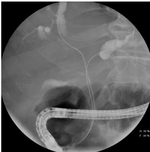
Figure 1 Hilar CCA. CCA, cholangiocarcinoma.

CCAs have a wide range of incidences geographically, with the most common locations being in East Asia, likely due to differences in genetic and environmental factors. Overall, the incidence of CCAs continues to rise, with the largest rise being amongst iCCAs. Within the United States, the incidence of iCCAs has been increasing by 2.3% per year over the last forty years, whereas the rate of extra-hepatic CCAs has largely been stable (4,5). There are many risk factors that have been identified to potentially contribute to the development of CCAs and explain the recent rise in incidence including inflammatory bowel disease, cirrhosis, choledochal cyst, diabetes, thyrotoxicosis and chronic pancreatitis. In regards to iCCAs specifically; smoking, hepatitis C infection and non-alcoholic liver disease are thought to be risk factors (6,7). Nevertheless, the majority of patients do not have an identifiable risk factor at diagnosis (8).