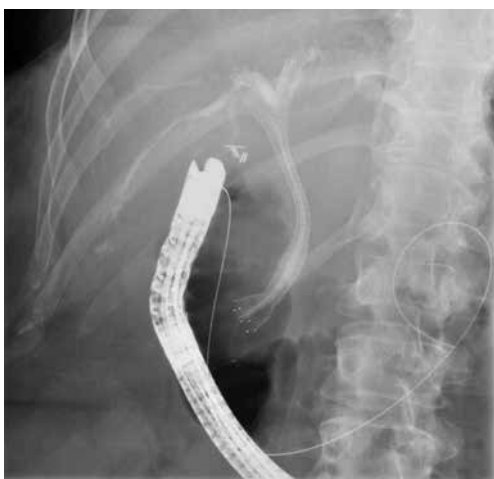
Figure 5 Side-by-side SEMS insertion. SEMS, self-expandable metal stent.

cost-less and can be placed in multiple segments without difficulty. The main disadvantage is that due to their smaller diameter, they require prophylactic stent exchanges to prevent obstruction. The most common size of plastic stents are 7 and 10 French in diameter. Self-expanding metal stents come in a variety of sizes, from 6 to 10 mm, and can be either uncovered, partially covered or fully covered. The advantage of SEMS is that they generally show longer patency, with the disadvantage being higher cost, and if uncovered, the inability to remove or exchange if needed. In