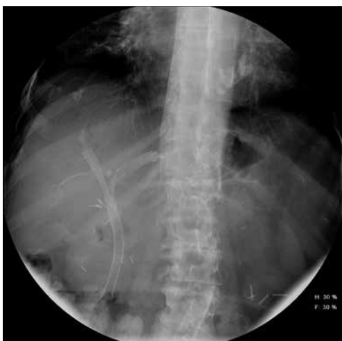
Figure 4 Stent-in-stent SEMS insertion. SEMS, self-expandable metal stent.