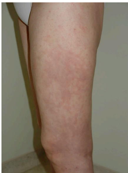
Figure 1 Maculo-papular rash after three cycles of ipilimumab. Grade 1.

after the third week of therapy, with its peak at the sixth week. Most of the cases are considered as grade 1, using CTC (less than 10% of body surface area involved) and may be accompanied by symptoms such as pruritus. Restricted lesions might be observed, eventually treated with topical corticosteroids such as betamethasone 0.1% or clobetasol 0.05%. No change in the ipilimumab schedule is necessary. Patients with symptomatic lesions and a body surface area involvement greater than 10% but less the 30% (grade 2), should be treated with topical or oral steroids (prednisone, up to 0.5 mg/kg/day, or equivalent). Rapid improvement is anticipated and the steroid is to be tapered according to medical evaluation. At subsequent ipilimumab infusion, there are of skin involved should be at most a grade 1 in order to proceed with the infusion. Otherwise, infusion must be rescheduled. Rare events of grade 3 rash (greater