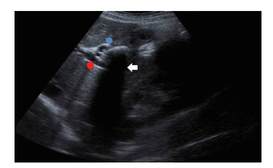
Figure 1 Ultrasound Mirizzi syndrome. Ultrasound image grayscale, echogenic image of nodular morphology observed with shadow acoustic back (arrow) located at the vesicular neck that determines compression and dilatation of the cystic duct (blue circle) and common hepatic (red circle) with retrograde incipient dilation of the right and left hepatic ducts.

response causes the external bile duct obstruction, and eventually the mucosa will erode progressing into a cholecystocholedochal or cholecystohepatic fistula that presents different degrees of communication between the bile duct and gallbladder (1,2,6,7,10,15,18-20,26). Ultrasound of Mirizzi syndrome in Figure 1 . Anatomic variations of the cystic duct, represented in Figure 2 ,