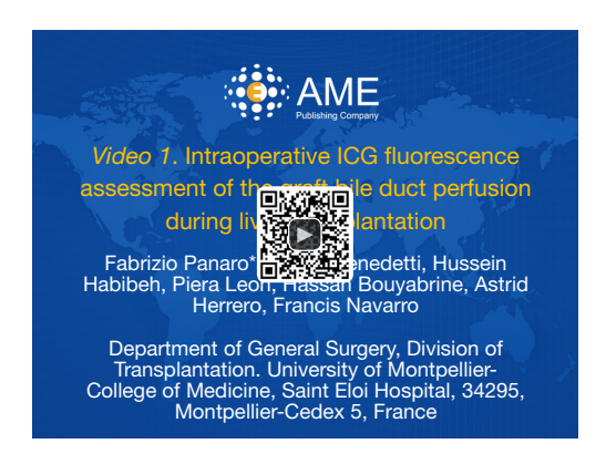
Figure 1 Intraoperative ICG fluorescence assessment of the graft bile duct perfusion during liver transplantation (7). ICG, indocyanine green. Available online: http://www.asvide.com/article/view/25317