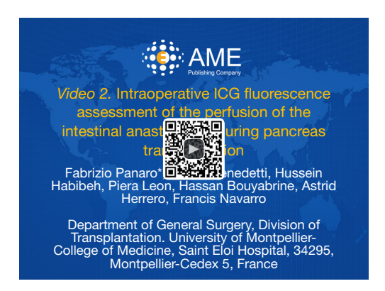
Figure 3 Intraoperative ICG fluorescence assessment of the perfusion of the intestinal anastomosis during pancreas transplantation (8). ICG, indocyanine green. Available online: http://www.asvide.com/article/view/25319

lateral portions previously resected using a linear stapler (Figures 3,4). We could evaluate, furthermore, the vascularization of the head of the pancreas and the site of the anastomoses between the graft duodenal stump and the recipient terminal ileum. We normally perform a side-to-side entero-enteric anastomosis with two running sutures of PDS 4/0. The patient receives a therapeutic dose of intravenous heparin for the first week after transplantation.