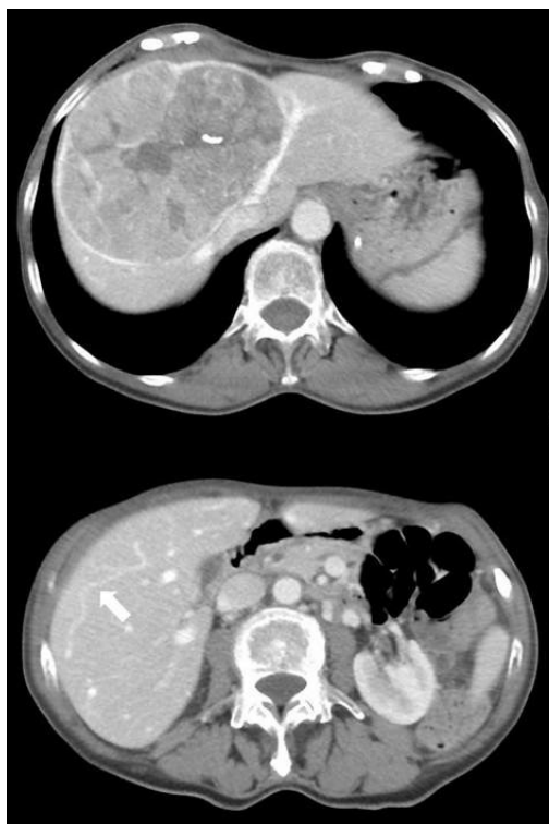
Figure 1 Preoperative CT revealed a huge tumor that involves the left and middle hepatic veins below their common root into the vena cava (case 1), and the presence of a communicating vein (white arrow) between the middle and the right hepatic veins.

congestion due to portal clamping. We report here the two first cases of a new technique of TVE with a temporary porta-caval shunt (PCS) and in situ portal hypothermic perfusion of the liver. In these cases the use of VVB and its subsequent risks are obviated.