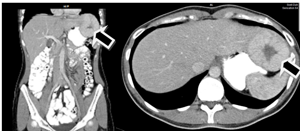
Figure 1 Magnetic resonance imaging (MRI) record of the operated patient with focal nodular hyperplasia (FNH). The tumor located in segments II and III of the liver, shown with black arrows.