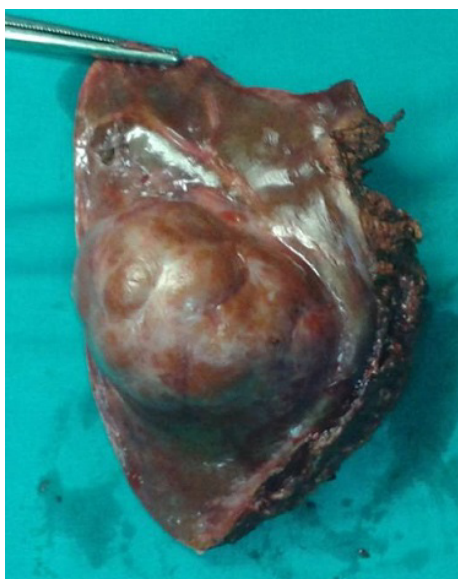
Figure 2 Resected tumor along with the segment II and III of liver.

and appendectomies are performed routinely and have outnumbered the open cholecystectomies and appendectomies that are done only in a narrow spectrum of indications. Apart from that the explorations, the ulcer perforation and hernia repair are performed laparoscopically, as well. During last 10 years the elective splenectomies and colon resections are performed laparoscopically in the high number of cases.