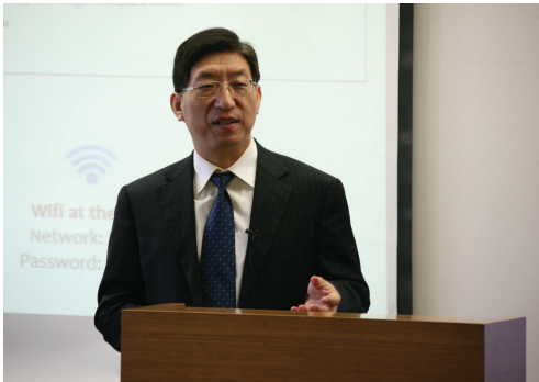
Figure 1 Professor Yixin Zeng, President of Peking Union Medical College, addressed the opening remarks for the conference.