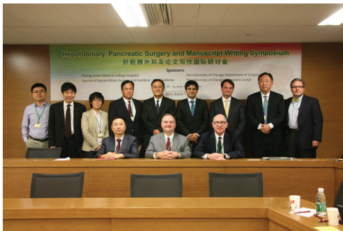
Figure 7 A picture of most invited speakers.

Cite this article as: Xu EX. To learn and to share: Hepatobiliary, Pancreatic Surgery and Manuscript Writing Symposium. Hepatobiliary Surg Nutr 2014;3(6):425-427. doi: 10.3978/j.issn.2304-3881.2014.12.03