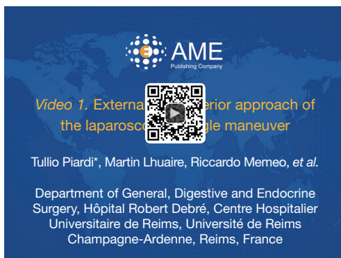
Figure 2 External and anterior approach of the laparoscopic Pringle maneuver (7). First part: external approach. Second part: anterior approach. The exhaustive procedure with their respective steps were explained in Figures 1 and 3 .

Available online: http://www.asvide.com/articles/1006