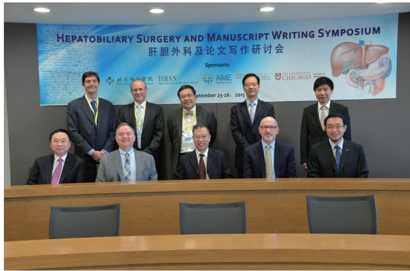
Figure 4 A picture of the most invited speakers.

and future progress in organ transplantation, hepatobiliary diseases and scientific manuscript. We gave our heartfelt thanks to all the speakers and organizers for their great support and contribution to this symposium ( Figure 4 ).