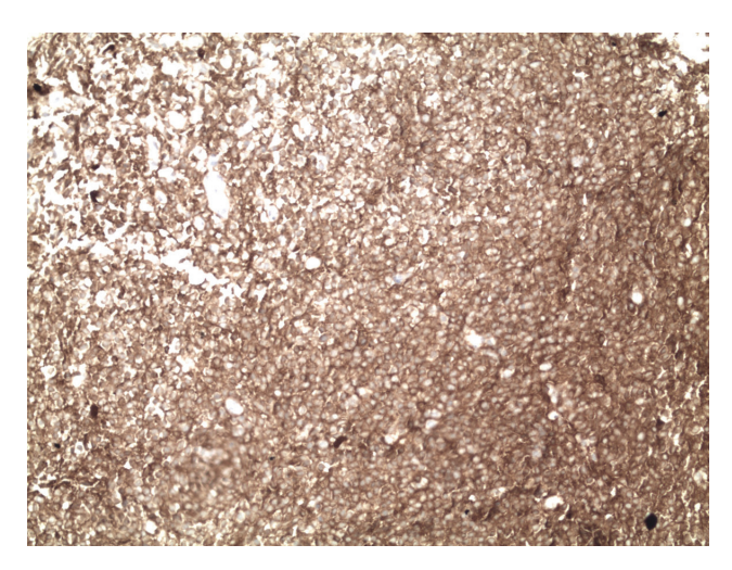
Figure 2 Tumor cells positive for CD20 (20x)