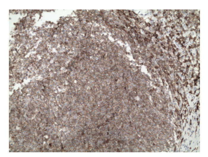
Figure 4 Tumor cells positive for CD5 (20x)

gastroscopy showed a large amount of fresh blood with multiple gastric ulcers. The largest ulcer, located in the anterior pyloric wall, measured 3 cm × 1.5 cm. Gastroscopy showed multiple nodular lesions in the gastric cavity ( Figure 1 ). Histopathologic examination of biopsies from the gastric lesions demonstrated mantle cell lymphoma. Under immunohistochemical staining, the tumor cells were positive for CD20, PAX5, CD5, cyclin D1, CD68, Bcl-2 and Ki-67 (40%), and negative for cytokeratin (CK), epithelial membrane antigen (EMA), CD23, CD10 and Bcl-6 ( Figures 2-4 ). Colonoscopy confirmed the results of the gastroscopy. Bone marrow aspiration biopsy showed typical