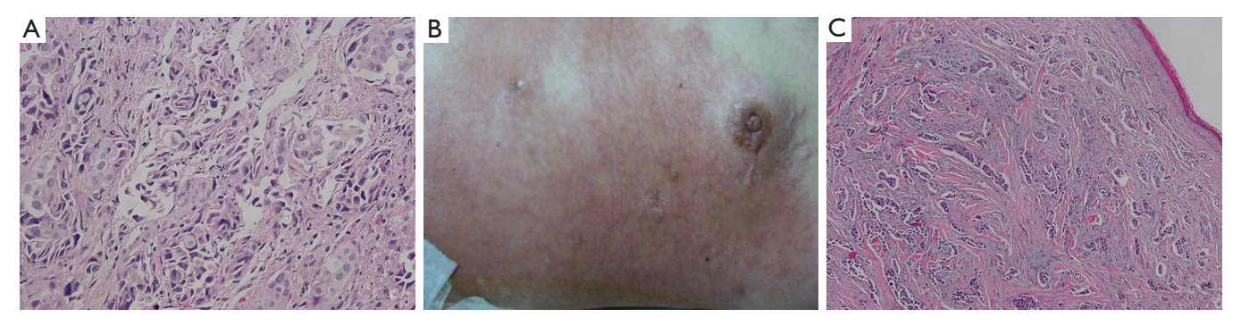
Figure 2 Hematoxylin and eosin (H&E) staining and erysipela-like appearance. A. Histological photomicrography of high-grade urothelial carcinoma arising in the bladder wall (×400); B. Erysipela-like appearance of the chest; C. A skin biopsy taken from an erythematous lesion in the suprapubic area showed metastatic cell infiltration in the dermis (×100)

urothelial carcinoma ( Figure 2A ). Consequently, the patient received chemotherapy with gemcitabin. Palmsized erythematous plaques on the left flank area and suprapubic area were observed approximately 1 month after the patient received chemotherapy, but the patient ignored these lesions. Three months after chemotherapy, the patient complained of extensive painful erythematous plaques with an erysipelas-like appearance located on the suprapubic area, chest and abdomen ( Figure 2B ). Physical examination revealed warm erythematous plaques on the left chest, left flank, and suprapubic, prepuce and scrotal areas with tenderness. No fever or leukocytosis was noted. Excisional biopsies were obtained from the left chest and