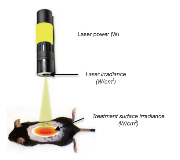
Figure 3 Clinical PBM dose delivery involves multiple terminology and objective treatment parameters that are often inaccurately reported. The term laser irradiance refers to the power output at laser probe/array. The treatment surface irradiance is the true irradiance of energy delivered to biological tissue interface. Accurate reporting of precise device parameters, especially treatment surface irradiance, should improve reproducibility and rigorous effectiveness of PBM treatment protocols. PBM, photobiomodulation.

temperature, when available, in future PBM studies to aid in robust future reproducibility of specific treatment protocols.