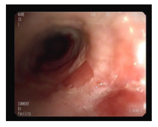
Figure 8 The imaging results of the 3<sup>rd</sup> endoscopic procedure.

technically possible. We decided to keep the stenting repair in case of a persistent leakage. However, stent insertions as well as a T tube placement are reported in the literature. Type of surgery should depend on clinical factors and surgical judgement and expertise (5-7).