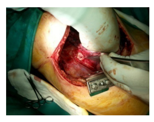
Figure 1 The exact point of the esophageal perforation (EP).

There are different surgical approaches, depending on the characteristics of the lesion (5,6).