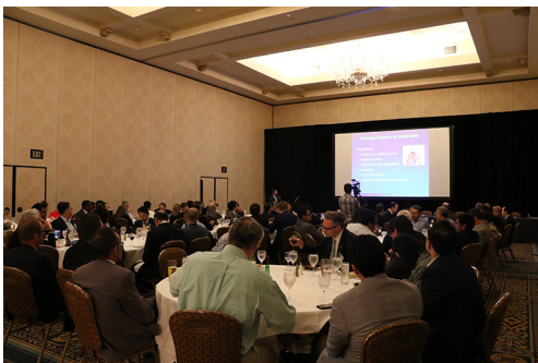
Figure 9 Night of fluorescence imaging.