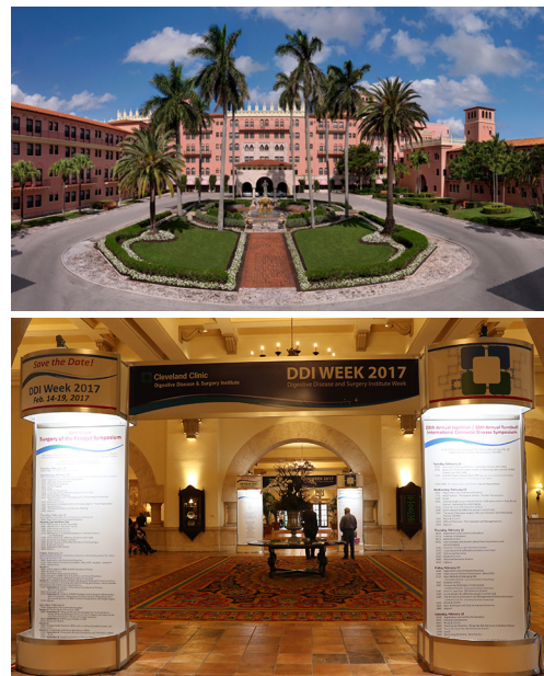
Figure 1 Meeting venue, Boca Raton Resort & Club.

It was an honor to receive an invitation from the committee to attend and witness the various events going on within the meeting. The meeting offered onsite