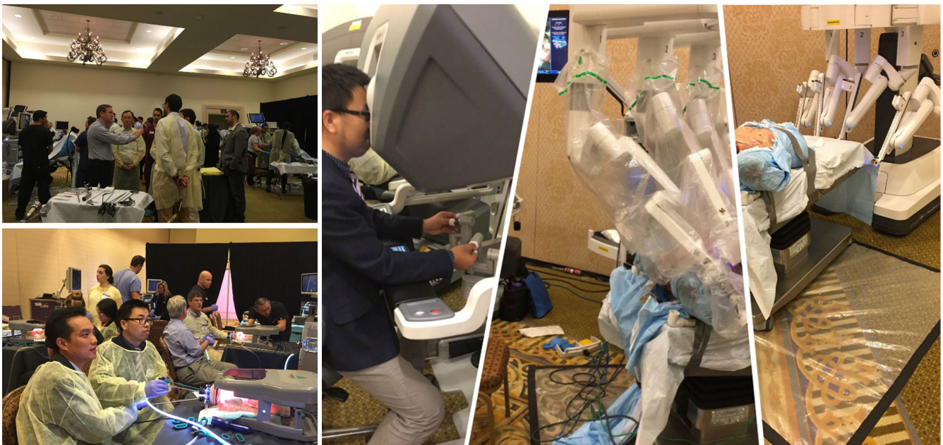
Figure 3 Sketch of hands-on workshops.