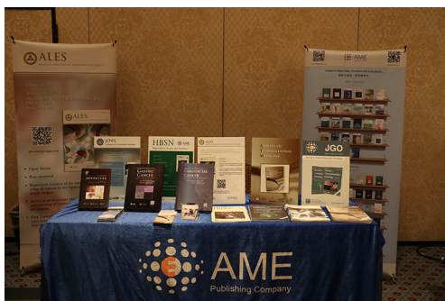
Figure 11 AME booth with journals and books.