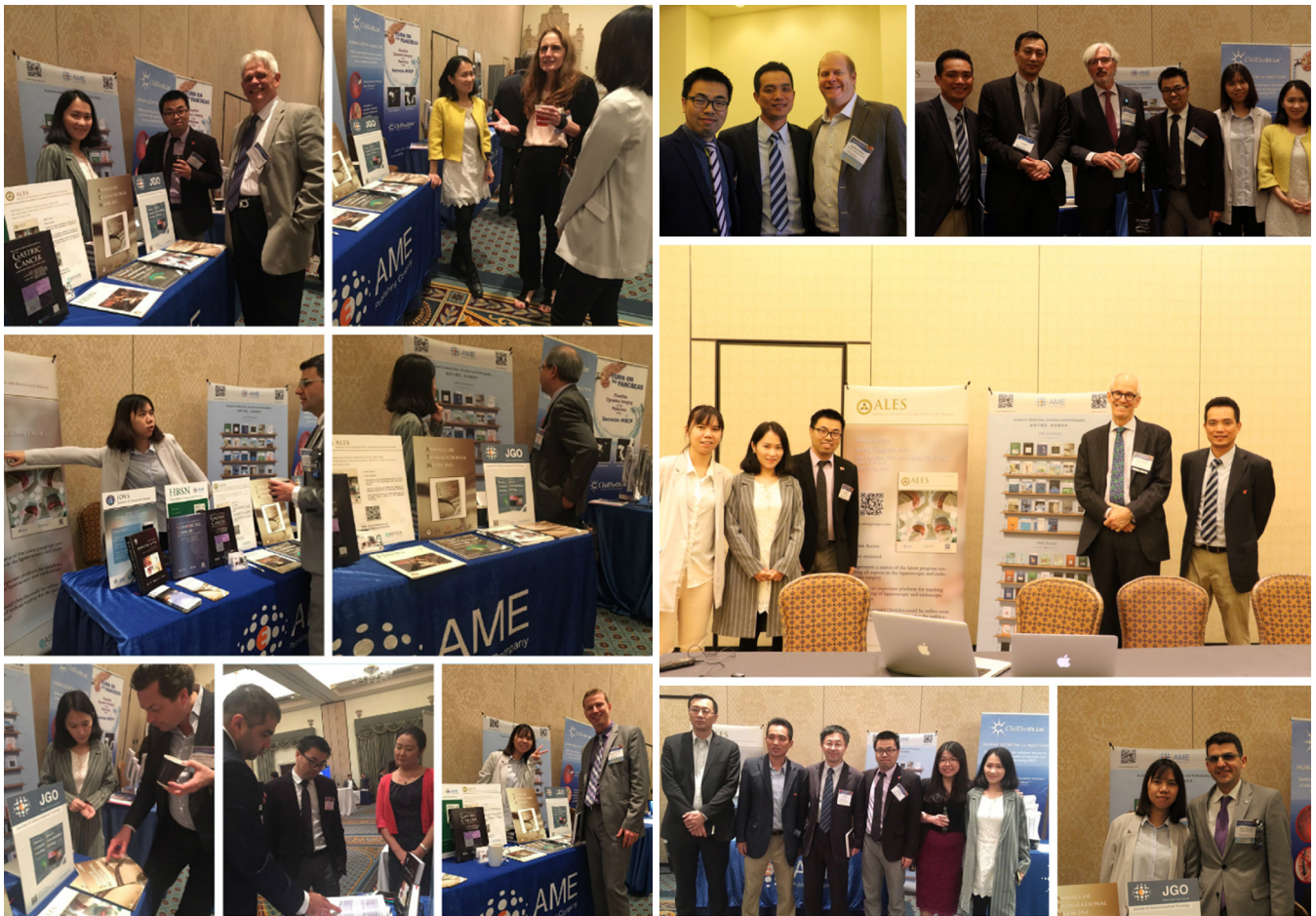
Figure 12 Sketch of our booth.