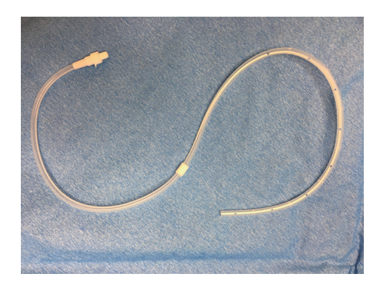
Figure 1 An example of an indwelling pleural catheter.

notoriously painful. Both topical and systemic analgesia is typically administered when doxycycline is used in an awake patient. Traditionally, opiate analgesics have been the preferred option for pain control while non-steroidal anti-inflammatory drugs (NSAIDs) have been avoided for fear of interference with pleurodesis. Notably, the TIME1 trial investigators compared the efficacy of talc pleurodesis in subjects with MPE receiving opiates for pain vs. those receiving NSAIDs and found pleurodesis outcome to be non-inferior with the latter. Doxycycline has not been associated with systemic toxicity such as ARDS.