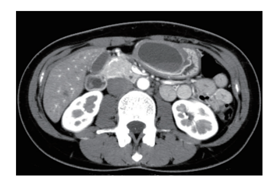
Figure 2 Contrast-enhanced computed tomography scan showing a cystic tumor with a diameter of 5.8 cm, with minimal enhancement of the septal wall.