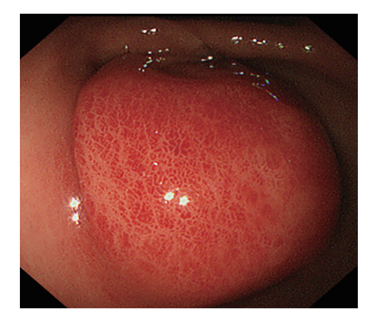
Figure 1 Gastroscopy image revealing a giant submucosal tumor obstructing the pyloric ring.