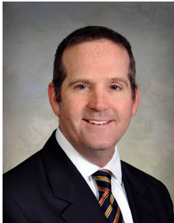
Figure 2 Dr. Matthew A. Faktor.

even less will be beneficial. This can be done by performing lesser cancer operations without compromising survival (such as pulmonary wedge resection or segmentectomy rather than lobectomy) or by performing identical operations in a less stressful way [such as video-assisted thoracic surgery (VATS) lobectomy or laparoscopic colectomy].