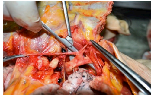
Figure 2 Right internal thoracic artery (RITA) arising from a common trunk with another artery.

The ITA was present in all individuals studied. The left internal thoracic artery (LITA) originated directly from the subclavian artery in 38/50 cadavers and from a common trunk with other arteries in 12/50. Right internal thoracic artery (RITA) originated from the subclavian artery in 49/50 cadavers, whereas in 1/50 arose from a common trunk with other arteries ( Figure 2 ). From their origin, the ITAs passed medially and downward behind the 2 nd to 6 th costal cartilages, at a distance of about 1 cm from the sternal margin. The course of both ITAs was rectilinear in the majority of cases ( Table 1 ). From the origin to the termination point, the length of LITA varied from 159 to