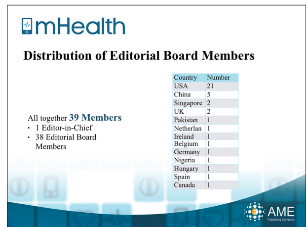
Figure 2 Distribution of editorial board members.