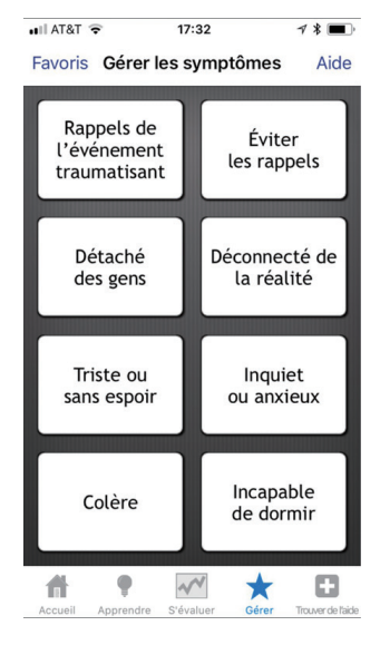
Figure 3 Manage symptoms screen of PTSD Coach Canada.

example to a healthcare professional, affording symptom monitoring data to be utilized in treatment. Additionally, a "clinician's guide" was developed to support use by mental health professionals—providing guidance for how to introduce the app to patients, use its functions, and integrate it into treatment (34).