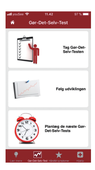
Figure 7 Track symptoms screen of PTSD Coach Denmark.

Store and Google Play. Since it was released, there have been more than 1 K downloads (~75% Android) with over 300 active users within the last 30 days.