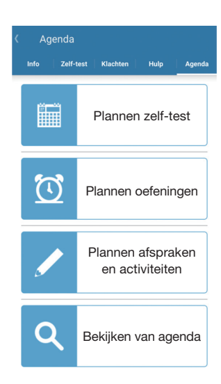
Figure 4 Agenda screen for SUPPORT Coach Netherlands.

of PTSD Coach Canada to reflect the recently released U.S version (i.e., 3.0) is in the planning stage.