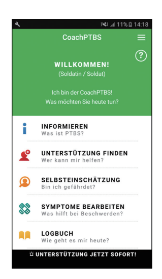
Figure 5 Home screen of CoachPTBS Germany.

it has been downloaded over 7 K times, with about 4 K of them for Android devices.