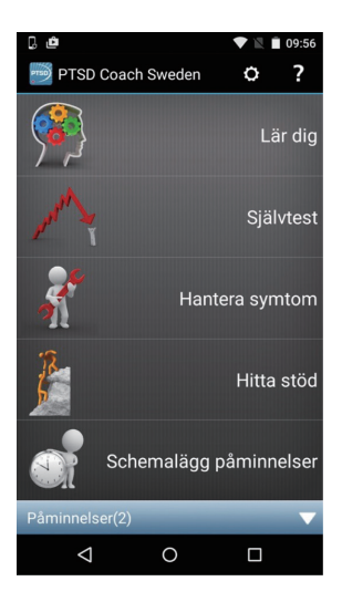
Figure 6 Home screen of PTSD Coach Sweden.

in terms of enhancing coping mechanisms and reducing PTSD and other symptoms.