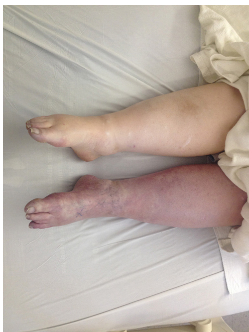
Figure 1 Patient with blue edema of the left lower extremity secondary to extensive deep venous thrombosis.

a massive pulmonary embolism. On physical examination, the patient had acute phlegmasia cerulea dolens (painful blue edema) of her left lower extremity (Figures 1 and 2)