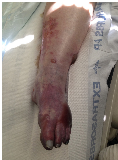
Figure 2 Patient with blue edema of the left lower extremity secondary to extensive deep venous thrombosis.