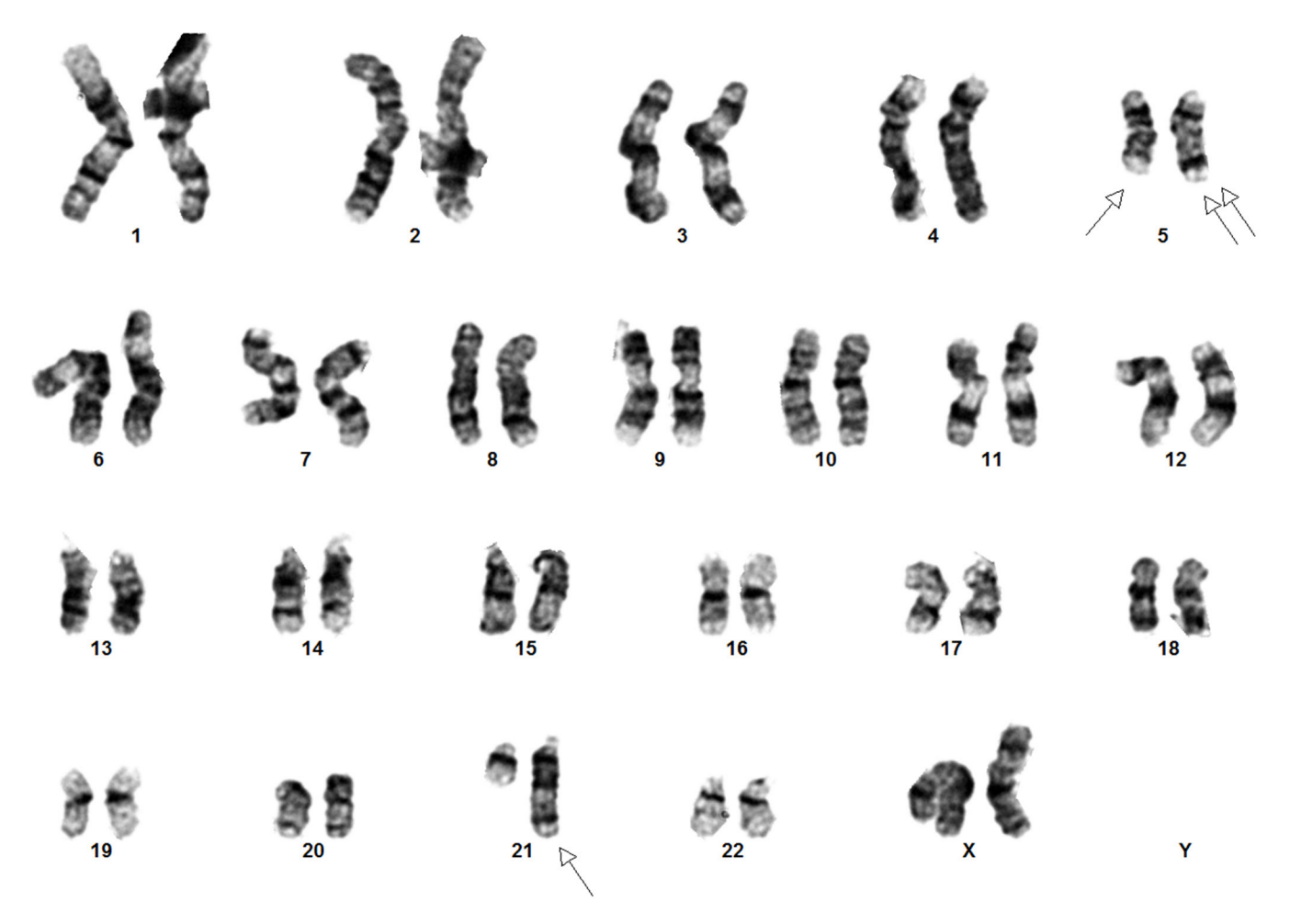
Figure 1 Representative G-banded karyogram showing t(5;21)(q15;q22) and del(5)(q13q33). Single arrows indicate t(5;12)(q15;q22) and double arrows indicate del(5)(q13q33).