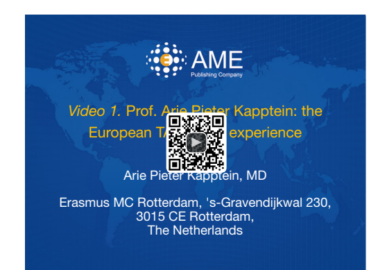
Figure 2 Interview with Prof. Arie Pieter Kapptein (1). Available online: http://www.asvide.com/articles/1318

For more details about this interview, please refer to the following video ( Figure 2 ).