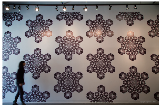
Figure 1 Digital print on vinyl, 55×50. Varied installation, dimensions (Grimm Lee, Emblem of Death , 2012)

Cite this article as: Lee G. Emblem of death. Cardiovasc Diagn Ther 2012;2(4):320. DOI: 10.3978/j.issn.2223-3652.2012.07.02