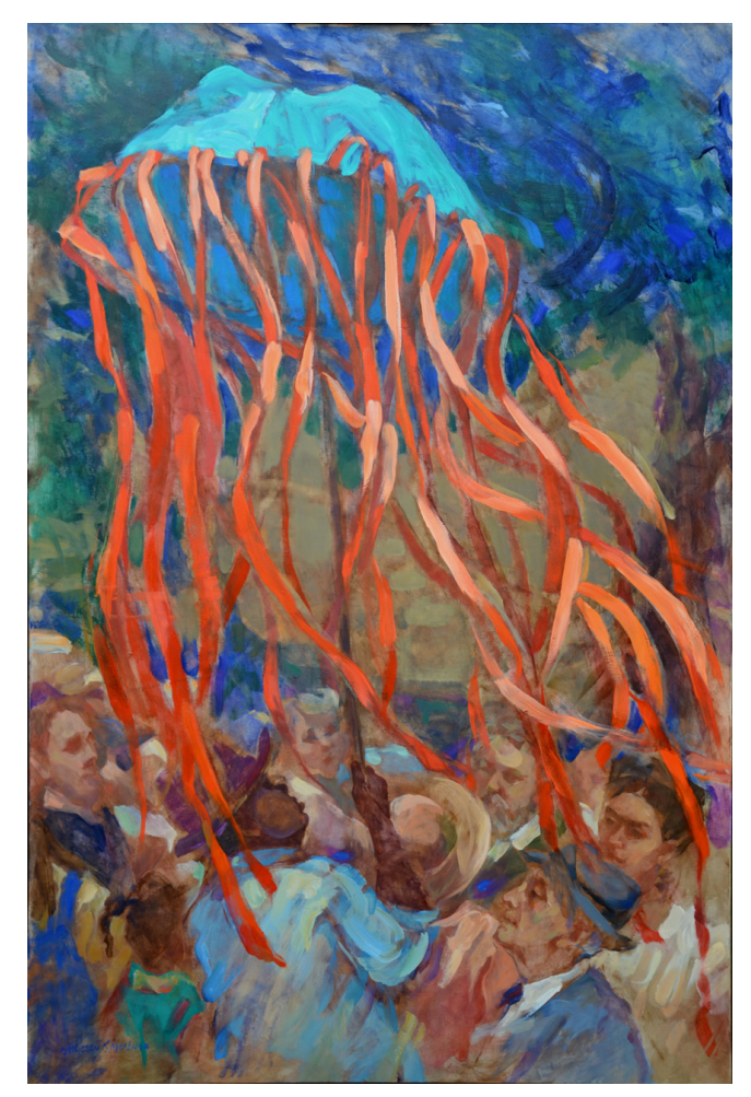
Figure 3 "Pentimento" oil on linen, 60" × 40"