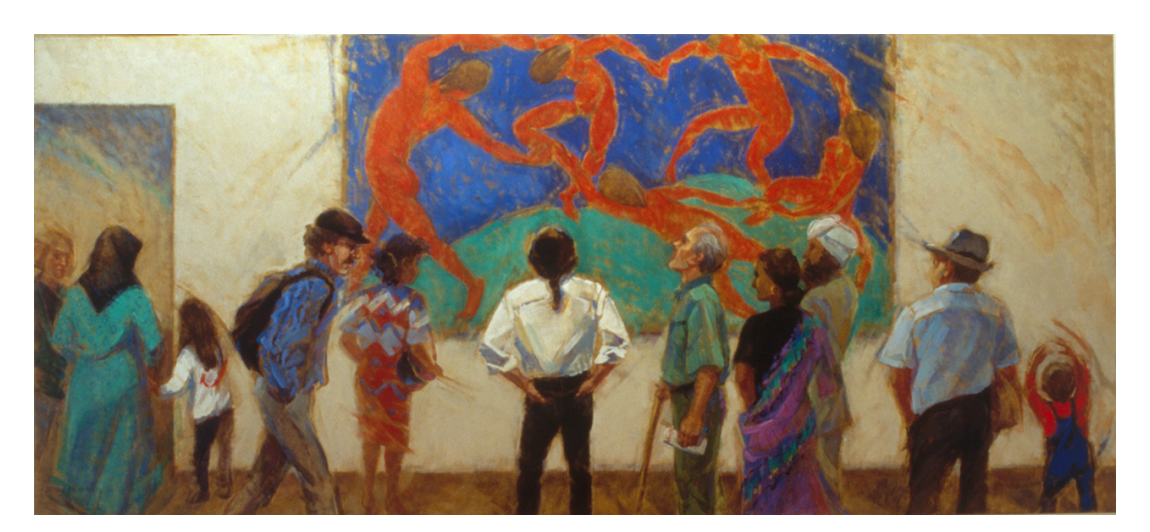
Figure 1 "The Power of DANCE" oil on linen, 50" \times 112" , collection: Cleveland Clinic

Disclosure: The author declares no conflict of interest.