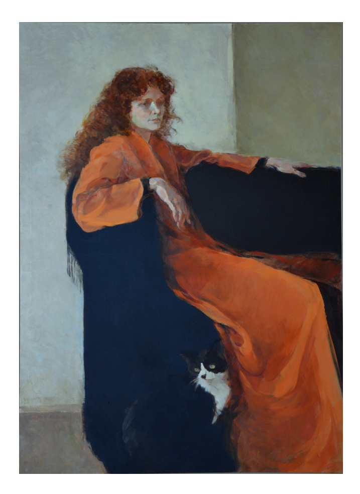
Figure 2 "Kindred Spirits" oil on linen, 54" \times 39", private collection