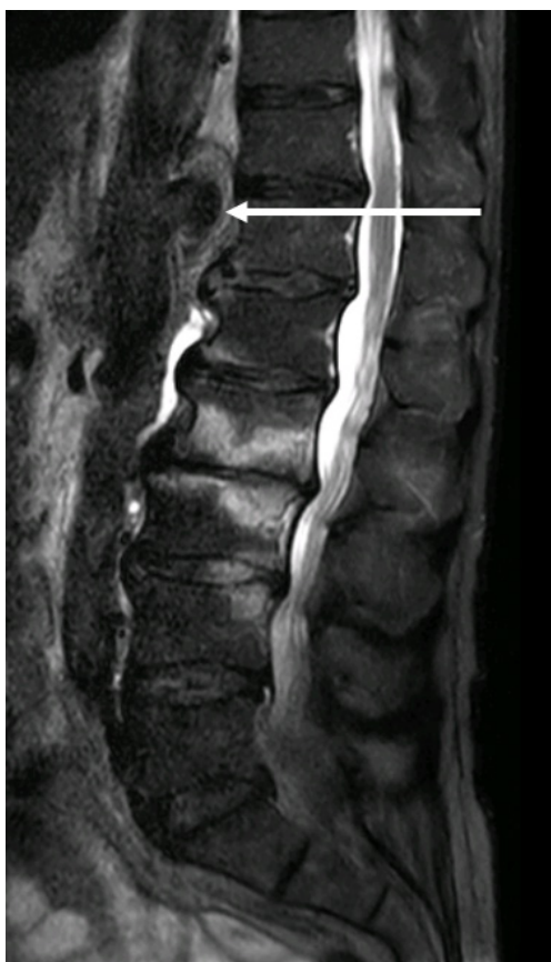
Figure 1 Sagittal T2 weighted images with fat suppression of the lumbar spine showing bone marrow edema of the lumbar vertebrae L2–L4, an irregular intervertebral disc L2–L3 and edema in the posterior part of the disc L3–L4. A saccular aneurysm protruding from the dorsal wall of the aorta at the level Th11–L1 is also seen (arrow) as well as edema of the surrounding retroperitoneal soft tissue.

in total. The infected aortic tissue from the distal thoracic aorta to the level of the mesenteric artery origin was resected surgically by an open approach and the aneurysm was replaced by a tube graft made of bovine pericardium. The superior mesenteric artery and celiac trunk were directly re-implanted to the graft. Genotypic analysis of the aortic wall tissue surgical specimen by PCR revealed the presence of Gram-negative bacteria ( Capnocytophaga canimorsus ), possibly transmitted through a bite from the patient's dog. The patient made a quick recovery. Post-surgery follow-up computed tomography imaging and blood tests revealed no signs of surgical complications and no signs of residual aortic or graft infection as well as a