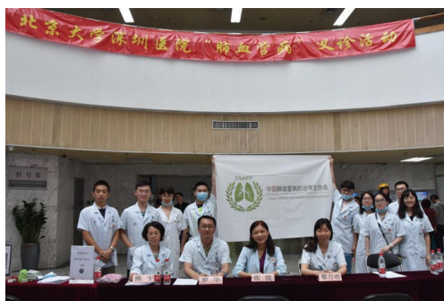
Figure 2 Free consultancy activity.