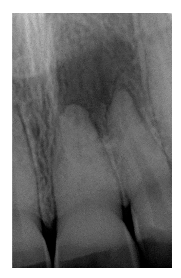
Figure 2 Maxillary left central incisor with radiolucency of the periapical tissue indicating chronic apical periodontitis following necrosis of the pulp tissue due to an untreated caries lesion.