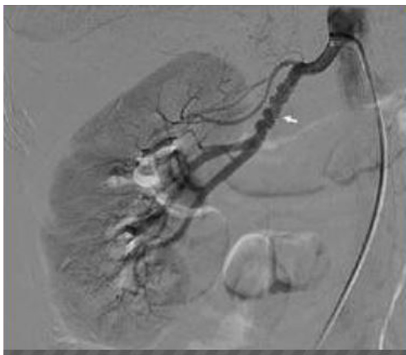
Figure 1 This figure depicts the media of the renal artery with fibromuscular dysplasia with the classic presentation of “string of beads”. This presentation is due to the alternate constrictions and post stenotic dilatations of the renal artery.

this review we performed a Medline search of the English language literature using the terms RAS and FMD of the renal arteries from January 2008 to December 31 2013. From the 58 papers reviewed, 19 pertinent papers were selected. The information from these papers together with collateral literature will be discussed in this concise review.