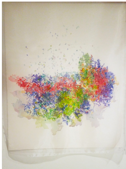
Figure 5 Protein model 2019. Mixed media on fabric based on X-ray models. Modular 28"×36".