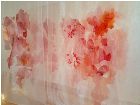
Figure 1 Hidden Features (Protein Microscopy), 2019. Mixed media on paper and fabric, based on microscopy images by Prof. Onn Brandmann, Biology Dept, Stanford University, CA; 5x(92"×60"×30").