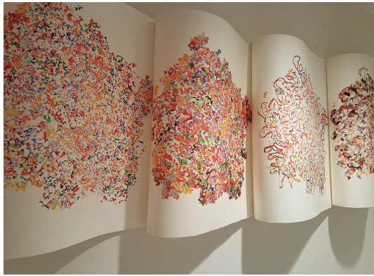
Figure 4 Protein scrolls 2017–19. Acrylic on paper and plastic based on X-ray models. Modular 5×(27"×80"×20").