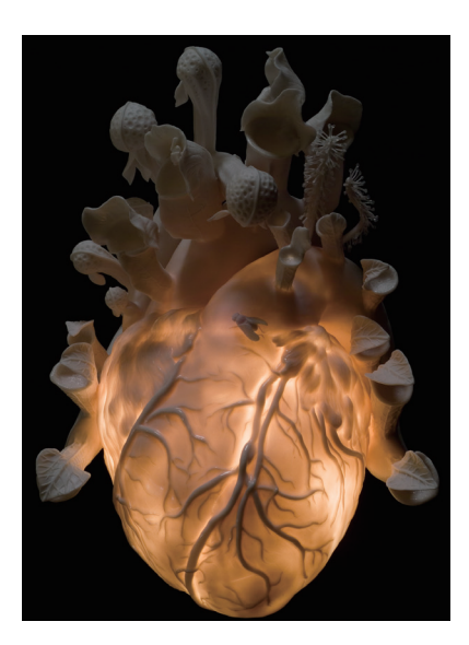
Figure 2 Venus. (9" \times 14" \times 9") , hand built porcelain, cone 6 glazes, acrylic gel, halogen light, wiring, 12/2006. Photographer: Dan Kvitka).

Cardiovascular Diagnosis and Therapy, Vol 5, No 6 December 2015