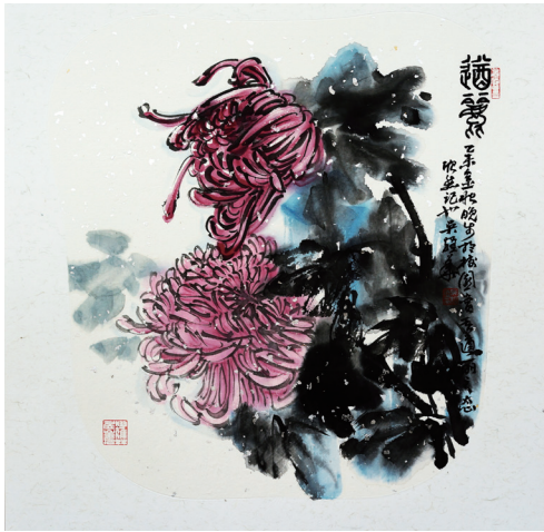
Figure 4 The chrysanthemum 4, Xuan paper.

Cite this article as: Wu YH. Chrysanthemums in full bloom. Cardiovasc Diagn Ther 2016;6(1):95-96. doi: 10.3978/j.issn.2223-3652.2015.12.03