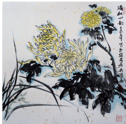
Figure 2 The chrysanthemum 2, Xuan paper.