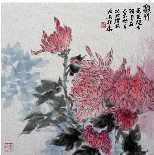
Figure 1 The chrysanthemum 1, Xuan paper.