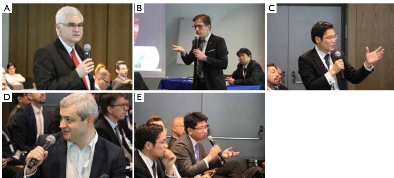
Figure 12 Discussion in the live surgery part 1.