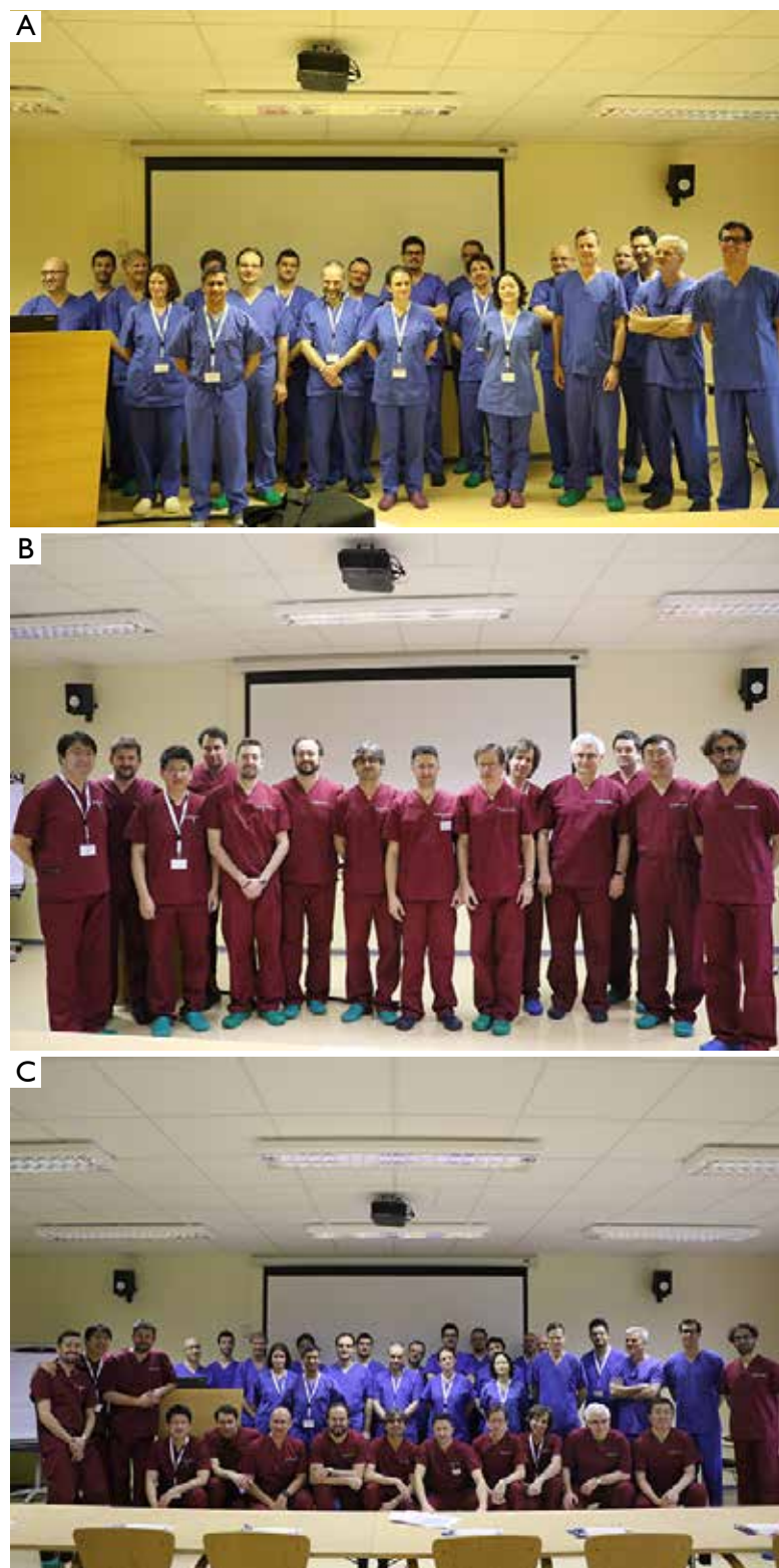
Figure 17 Wetlab group.