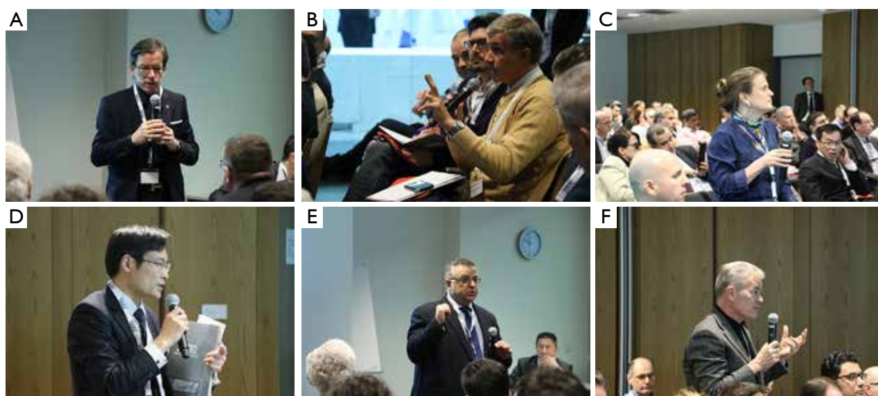
Figure 9 Active discussion.