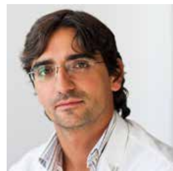
Figure 2 Prof. Diego Gonzalez-Rivas.

impressively shared by world-known thoracic surgeons all around the world (Figures 4–6). About 130 participants from different countries in the world were attending the course (Figure 7).