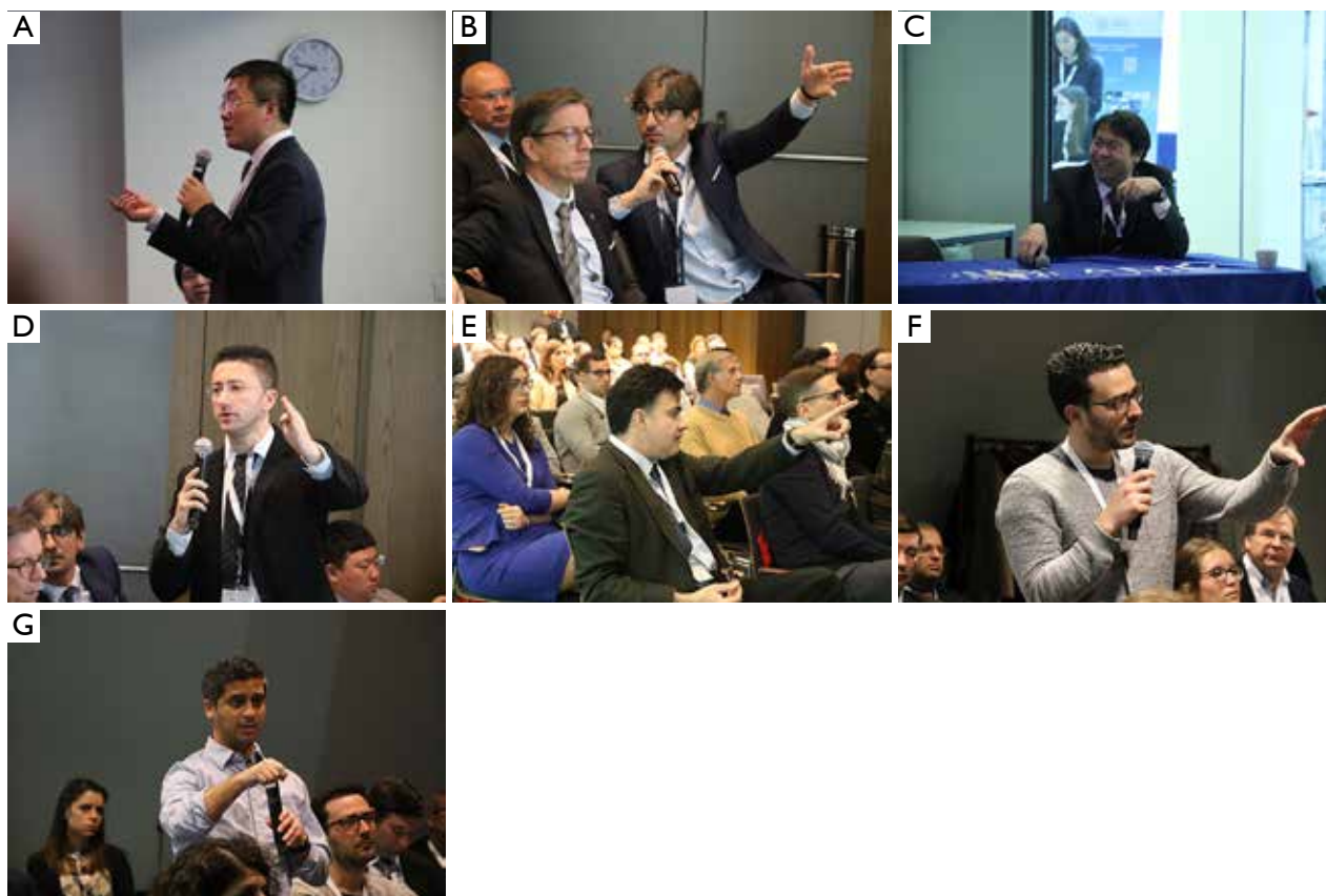
Figure 13 Discussion in the live surgery part 2.