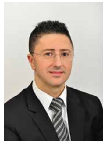
Figure 1 Prof. Mahmoud Ismail.

On the first day, the focus lied on the lecture sharing. Tremendous speeches on research instructions in thoracic surgery, different approaches in uniportal VATS, tips and tricks of operative technique in uniportal VATS, advanced cases, future vision of uniportal VATS and so on were