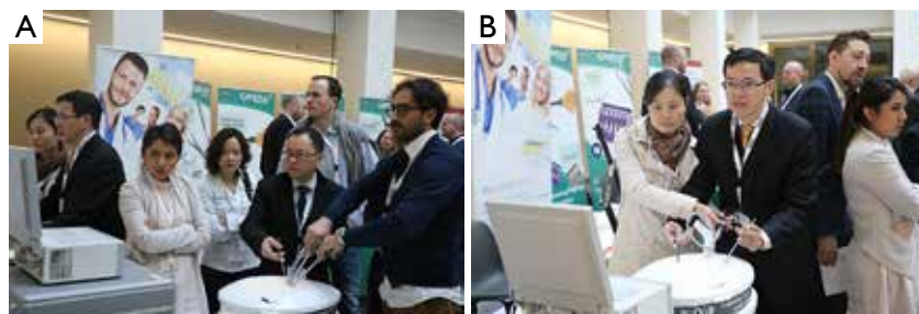
Figure 14 VATS simulation practice.