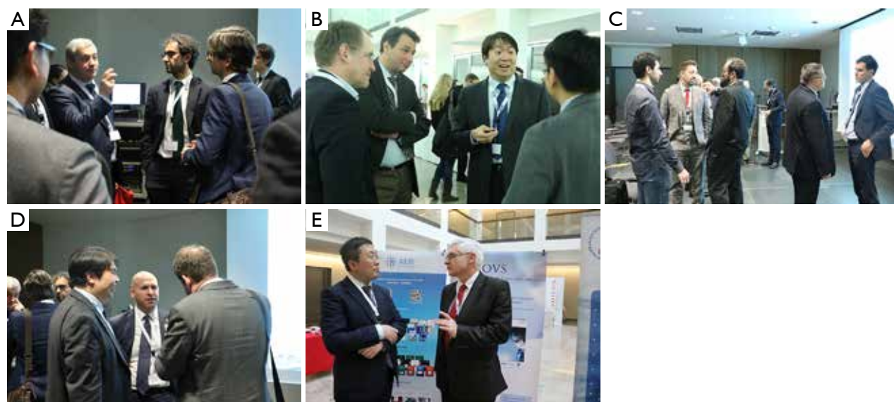
Figure 11 Chatting after the day.