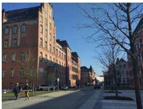
Figure 3 A glance on the Campus Charité Mitte (CCM).

To fit with the theme of this course, we brought two