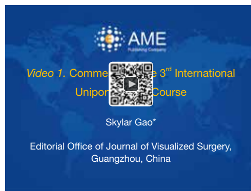
Figure 23 Comments on the 3 rd International Uniportal VATS Course (1). Available online: http://www.asvide.com/articles/961