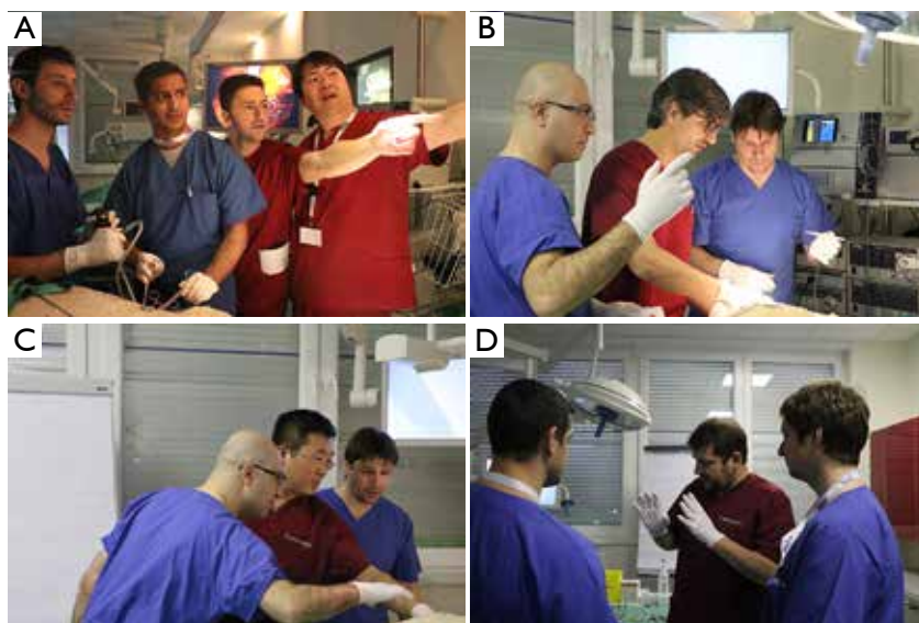
Figure 16 In the Wetlab.