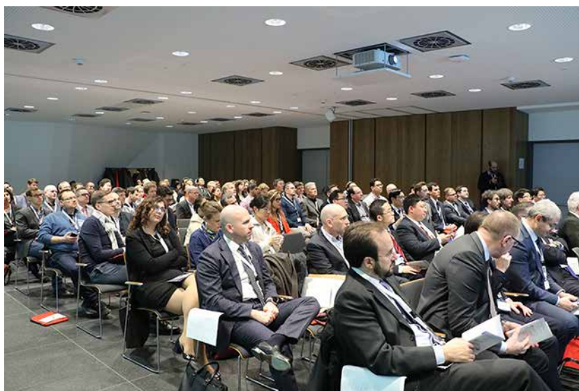
Figure 7 Fully occupied meeting room, about 130 participants from the whole world.