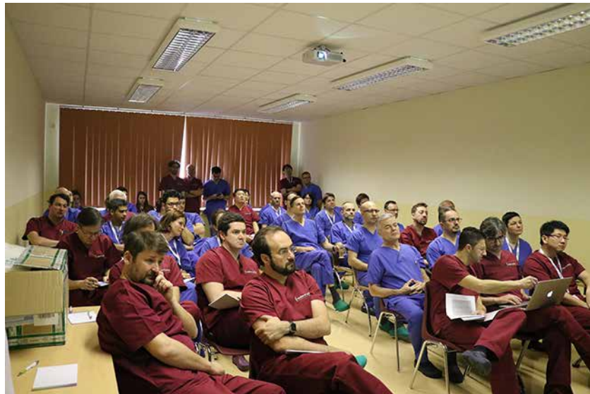
Figure 15 Before the Wetlab.