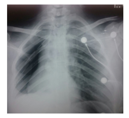
Figure 6 Postoperative chest X-ray.

The vital signs of the patients were stable during the surgery with estimated blood loss of about 800 cc. After returning to supine position the patients were extubated and were transferred to the critical care unit. The patients were allowed to drink and eat after 2 hours and were sent back to the thoracic surgery department ward next morning. Recovery after the surgery was fast and easy. Postoperative pain was minimal; chest X-ray was excellent ( Figure 6 ). Chest tube was removed after 2 days and the patient was discharged to home on 3^{rd} day postoperative. Final pathology report was typical carcinoid tumor that 1 cm away from the bronchial and vascular surgical margin.