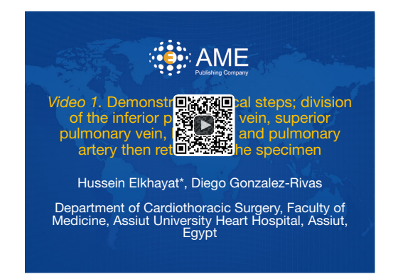
Figure 4 Demonstrate surgical steps; division of the inferior pulmonary vein, superior pulmonary vein, bronchus and pulmonary artery then retrieval of the specimen (3). Available online: http://www.asvide.com/articles/963