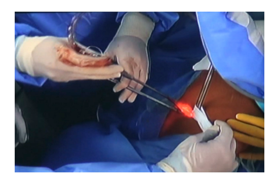
Figure 7 Gauze wrapped around the scope to fix it in its superior position.