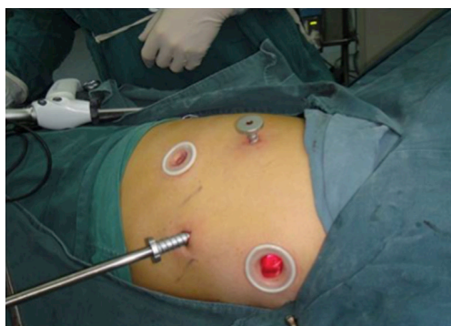
Figure 2 Location and size of the four incisions.

space in the right midaxillary line, and was used for the camera. The second 3 cm long incision was made in the fourth intercostal space in the right preaxillary line for the assistant, which was used mainly to pull down lung tissue to get good exposure. The third 2 cm incision was performed in the eighth intercostal space in the scapular line and the fourth 0.5 cm incision in the seventh intercostal space in the scapular line as the operating hole. Incisions were retracted with a soft protector ( Figure 2 ).