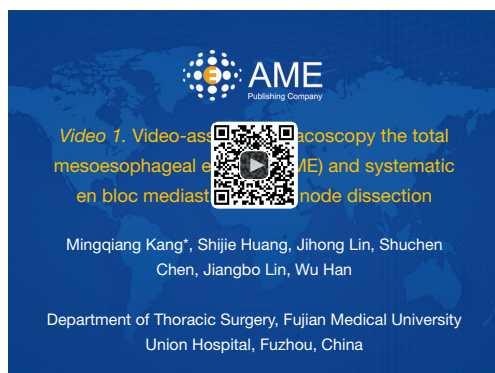
Figure 3 Video-assisted thoracoscopy the total mesoesophageal excision (TME) and systematic en bloc mediastinal lymph node dissection (7). Available online: http://www.asvide.com/articles/988

esophageal cancer, which greatly reduced the surgical trauma and improved the postoperative life quality of the patients (8). In this whole process, it's important that the careful coordination was required between the surgical and anesthesia teams. We concluded that mesoesophagus is a special kind of organization structure that parcel in paraesophageal fatty tissue, nerves and blood vessels and lymph nodes, and which is in the same structure of dissection, and The direct metastasis and lymph node metastasis of esophageal cancer were performed along the esophagus(1,3-5). So we believe that TME and the complete resection of lymph node can improve the radical of the operation, and put forward that the surgery strategy of TME is to take mesoesophagus, vascular and lymph nodes as the core, and dissect it along the anatomical space. Therefore, it is a complete and feasible surgical procedure that TME and systematic en bloc mediastinal lymph node dissection via VATS was performed. However, this demanding procedure should be performed by experienced thoracic surgeons and in selected patients.