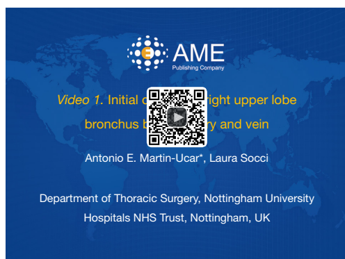
Figure 1 Initial division of right upper lobe bronchus before artery and vein (33). The direct view of uniportal surgery allows for the surgeon to choose the strategy for any individual case. In this case during an upper lobectomy the recurrent branch of the pulmonary artery is first dissected and divided followed by the division of the upper bronchus. The division of the anterior hilar structures (upper truncus of pulmonary artery and upper pulmonary vein) were performed after.

Available online: http://www.asvide.com/articles/1008