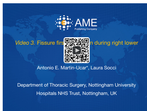
Figure 3 Fissure first dissection during right lower lobectomy (35). The exposure that uniportal VATS produce has helped the options of dissection of the fissures first in the same way it would be performed in open surgery. In this case of a right lower lobectomy the pulmonary artery was first dissected in the fissure and divided after completion. The lower bronchus was divided after and finally the inferior pulmonary vein.

Available online: http://www.asvide.com/articles/1008